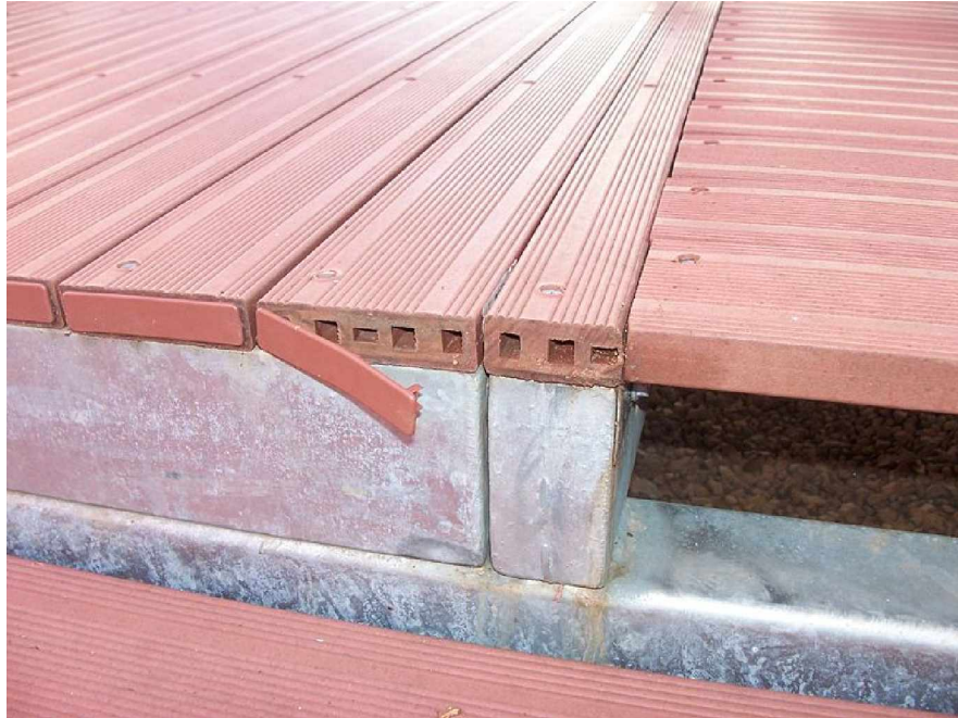
Hollow extruded MDF decking boards, which appear to have the coloring/preservative in the manufacture

In Australia the main species of tree used for MDF is plantation-grown radiata pine. However a variety of other products have also been used including other woods, waste paper and fibres.