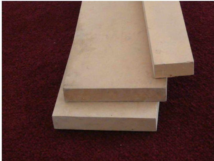
A Sample of MDF

MDF is also known as Custom Wood or Craft Wood.